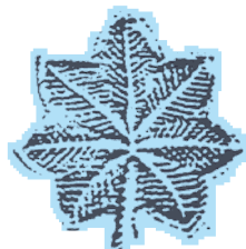
(SILVER) DEPUTY CHIEF