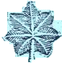
(GOLD) ADMINISTRATIVE ASSISTANT TO THE SUPERINTENDENT, ADMINISTRATOR OF PERSONNEL SERVICES COMMANDERS, COORDINATORS, DIRECTORS,