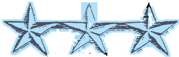
(SILVER) FIRST DEPUTY SUPERINTENDENT