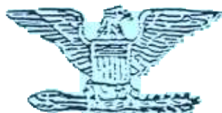
(SILVER) ASSISTANT DEPUTY SUPERINTENDENT- BUREAU OF OPERATIONAL SERVICES OPERATIONS COMMAND