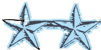
(SILVER) DEPUTY SUPERINTENDENT