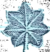
(GOLD) ADMINISTRATIVE ASSISTANT TO THE SUPERINTENDENT, ADMINISTRATOR OF PERSONNEL SERVICES COMMANDERS, COORDINATORS, DIRECTORS,