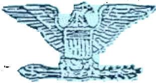
(SILVER) ASSISTANT DEPUTY SUPERINTENDENT- BUREAU OF OPERATIONAL SERVICES OPERATIONS COMMAND