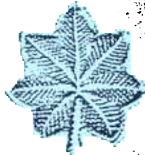
(SILVER) DEPUTY CHIEF