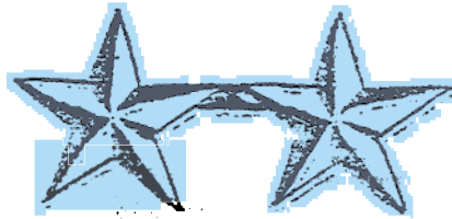
(SILVER) DEPUTY SUPERINTENDENT