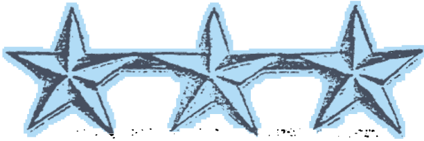
(SILVER) FIRST DEPUTY SUPERINTENDENT